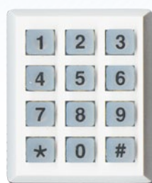
Wireless Mini Keypad Model: WKP