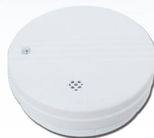
Wireless Smoke Detector Model: SMODETW