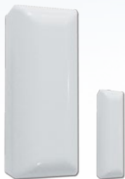
Wireless Reed Switch Model: WREEDI

Easily expand your system with door/window security, fire detection and emergency response