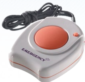
Panic/Emergency Pendant Model: WPANIC