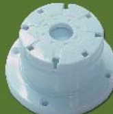
1 x Indoor "Top Hat" Piezo Siren