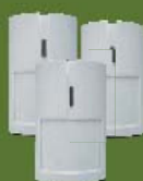
3 x High Quality PIR Sensors