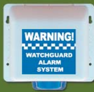
1 x Outdoor Siren/Strobe