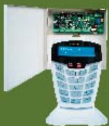
1 x 8 Zone Alarm Control Panel with LCD Keypad

If you're looking for complete home or commercial building protection, you NEED one of the Watchguard™ Complete Hardwired Alarm Systems. Available in both an 8 zone panel and a 16 zone panel, each kit also contains an internal and external siren, motion sensors, reed switches, emergency panic button and all necessary power supplies and cabling. These detectors and sirens help protect ALL areas of your home or building by performing functions such as monitoring rooms and offices for movement, and detecting when doors or windows are opened. This gives you greater peace of mind that your building is secured against thieves, burglars and vandals.