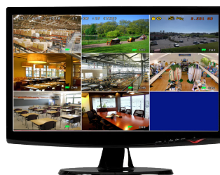
19" LCD Monitor