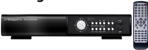
1 x 4 Channel H.264 Stand Alone Digital Video Recorder With Network Functionality, Remote Access & 1TB Hard Drive