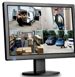
1 x 18.5" LCD Monitor