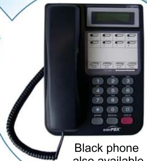
Black phone also available